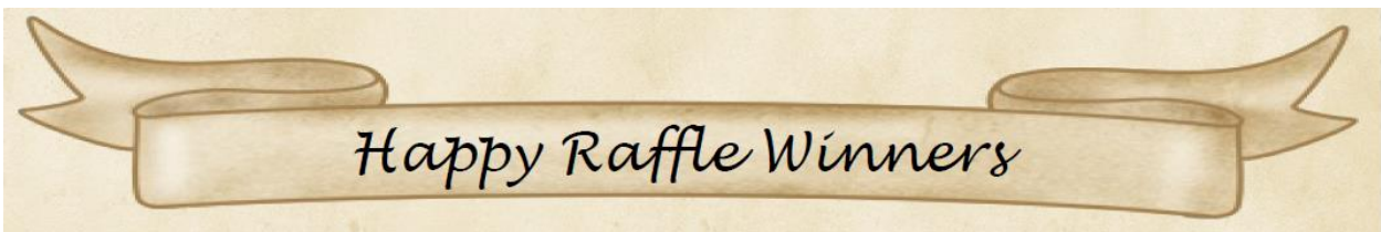
There were plenty of winners but no photos taken.