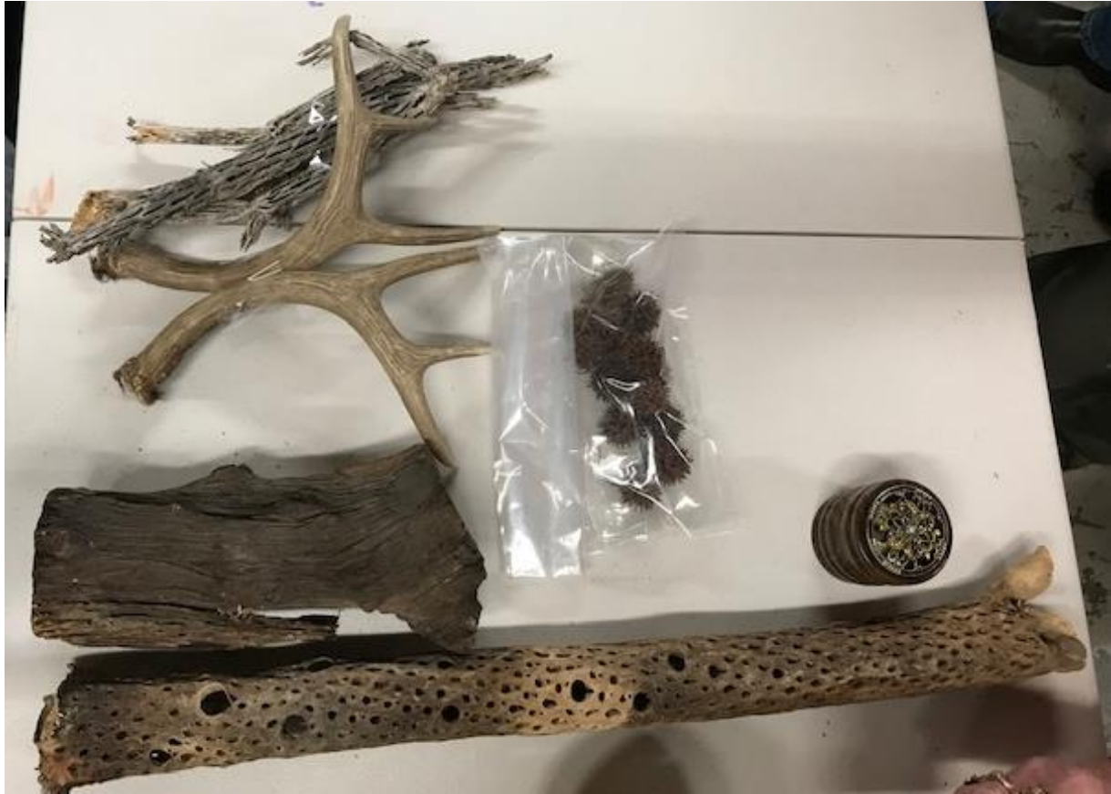
Some of the items for the Raffle