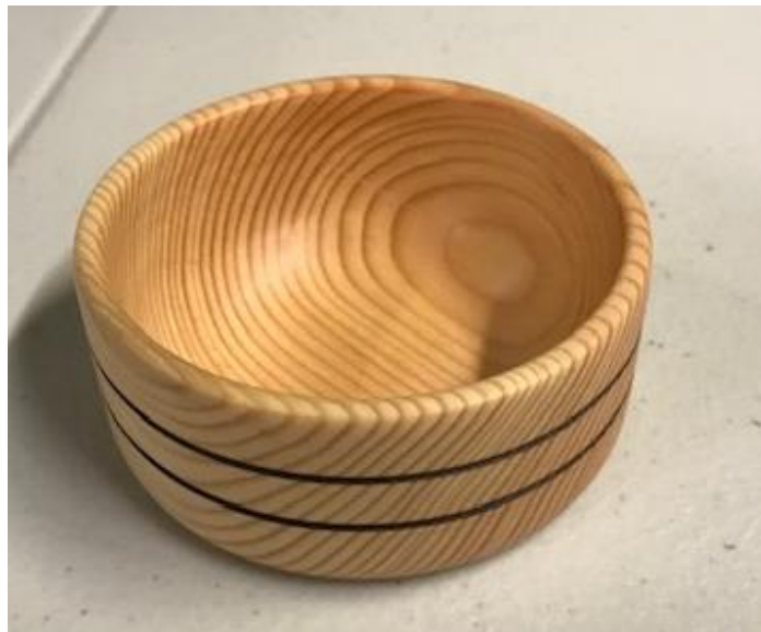
Sid Bright – 2x4 pine wood bowl

Silver Maple Burl with Sapele Finials with friction finish