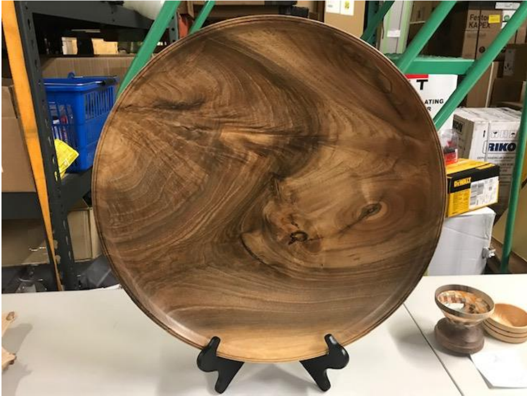
Dan Oliphant – 20" x2" English Walnut