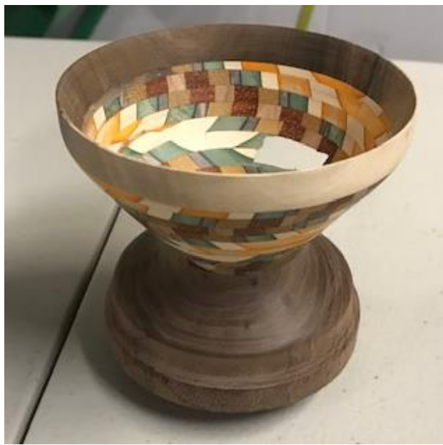
Sid Bright – Segmented work that was a little thin